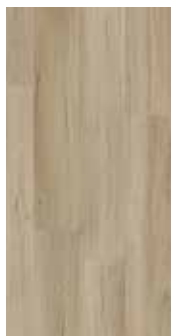
Kennett Product Code: 917