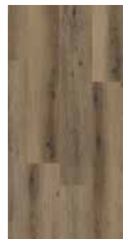
Gables Product Code: 9120

PLANK SIZE: 1830 x 230 x 7mm BOX (6pcs): 2.1sqm