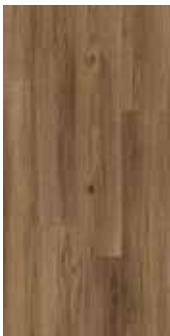
Rustic Spotted Gum Product Code: 911