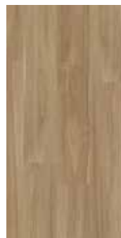
Parker Hill Product Code: 918