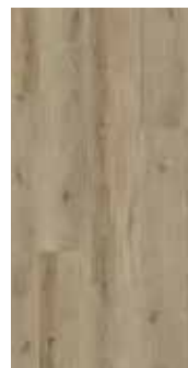
Airlie Product Code: 919