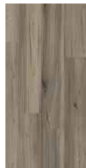
Torquay Product Code: 915