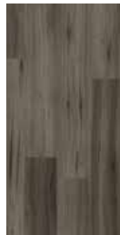
Bancoora Product Code: 914