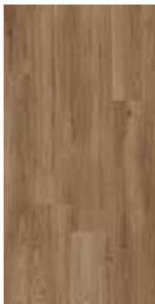
Coastal Spotted Gum Product Code: 912