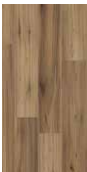
Fairhaven Product Code: 916