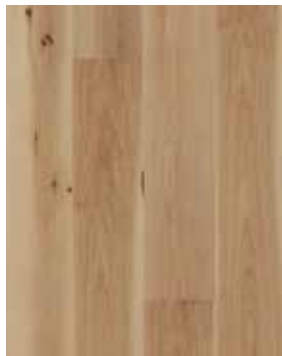
Hickory Product Code 706