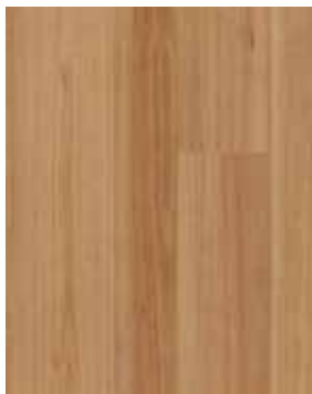
Blackbutt Product Code 702