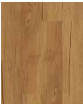
Marri Product Code 704