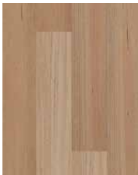
Tasmanian Oak Product Code 705