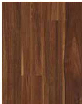
Blackwood Product Code 703