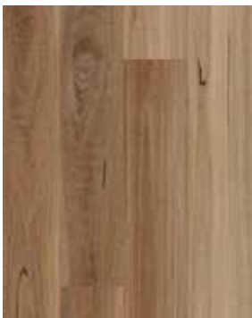
Spotted Gum Product Code 701